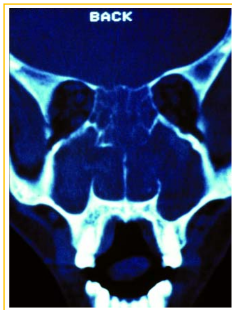
Figure 10.3. Pansinusitis with polyps, mucosal edema (or fluid-fill- ing nose), ethmoid sinus, and maxillary sinuses.