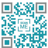
Table 6: Patient Information Sheet on Treating Acute Bacterial Rhinosinusitis: www.entnet.org/patient-information-ABRS

For more information and additional resources visit: www.entnet.org/adultsinusitisCPG