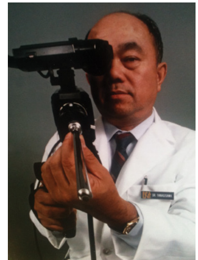
Eiji Yanagisawa, MD's extensive library of more than 495 ear, nose, and throat images is housed on the Foundation's website and images can be searched alphabetically, by donor, or by MeSH tree taxonomy.